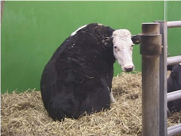
Fig. 2 Dog sitting posture

Weakness, paresis and incoordination of the gait (ataxia) are usually first noticed in the hindquarters. There may be lateral swaying and (or) dropping down of the hindquarters and an increased frequency of stumbling, slipping or falling. Pacing has also been observed [19]. Knuckling of the fetlocks is an infrequent feature of BSE, which was reported in less than 10% of cases early in the epidemic [12,16]. Spasticity, postural tremors and ataxia become more severe as the disease progresses. A mild degree of hypermetria may be present in addition to spasticity ( see video ). Progressive neurogenic gait deficits may eventually lead to recumbency. One or both hind limbs may be stretched out behind in recumbent cattle [20] (Fig. 3).