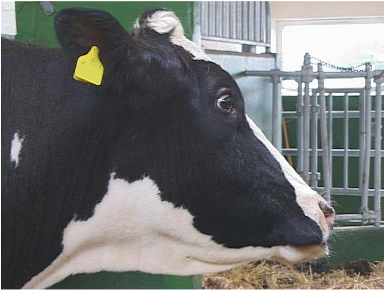
Fig. 1 'Staring expression'

frequently but very dangerously, BSE cases may show unprovoked aggression towards people ( see video ).