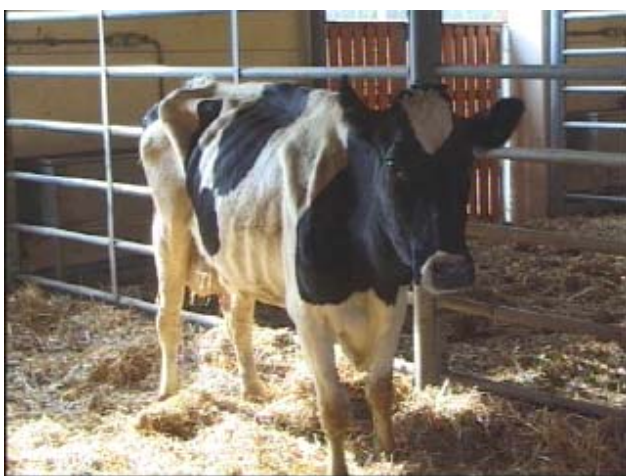
Fig. 4. Loss of bodily condition

Loss of weight and condition (see Fig. 4) is a frequent feature of BSE and may be its very first sign.