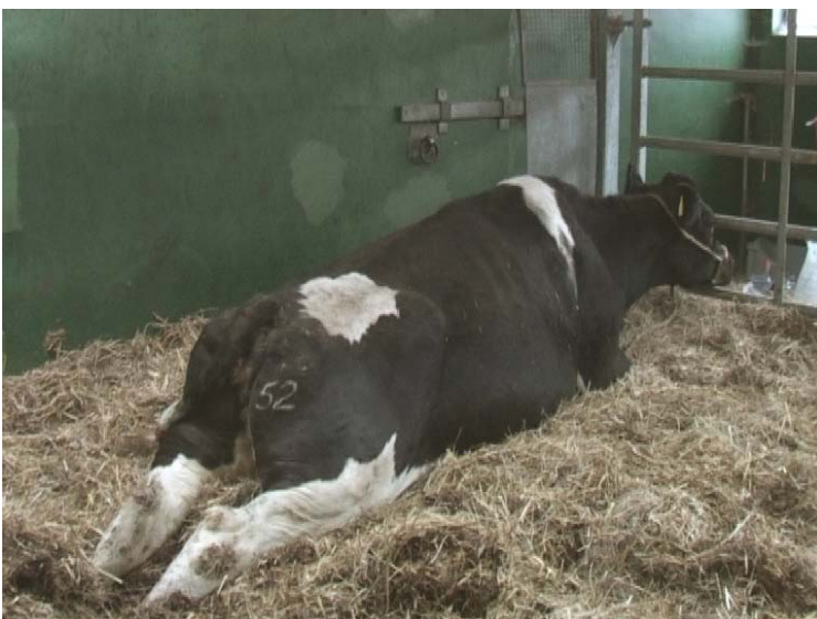
Fig. 3 Cow in sternal recumbency with both hind limbs stretched out behind

Recumbent cattle should be considered as BSE suspects unless an alternate cause of recumbency can be clearly established.